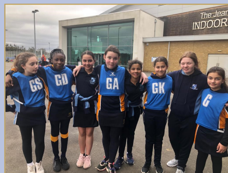
U11 Oak-Tree netball team

Senior Games Years 9 and 10 boys spent a recent Games lesson learning how to lineout lift in rugby. All boys learnt how to throw, lift or be lifted.