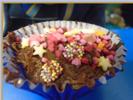
Yummy chocolate cake!

They have enjoyed going round the world to different countries. In Canada, They learnt about how maple syrup is made from maple trees. They visited Australia, trying a typical Australian snack called 'fairy bread' and also created some beautiful Aboriginal Art work. They found out that cocoa beans grow on trees in warmer countries like Ghana and Brazil, and learnt about how chocolate is made.