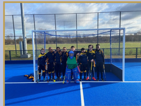
ISA National hockey

ISA National Hockey Our U11 boys hockey team took a trip to the Olympic Hockey and Tennis Centre at Stratford to take part in the ISA National Hockey Tournament, where the boys got to experience hockey at the highest possible level in their age group. In the group they narrowly lost the first two games 2-0 and 1-0 respectively before losing to eventual quarter-finalists Chafyn Grove who were by far the strongest team played on the day. The boys took lunch in the Olympic Hockey Stadium and enjoyed soaking up the atmosphere and experiencing one of the London 2012 Olympic venues. In the afternoon session they entered the plate semi-finals, narrowly losing out to Oakfield Prep School. All of the boys thoroughly enjoyed the day, and are now looking forward to future fixtures against St. Aubyn's and Avon House