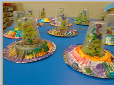
Aliens spaceships have landed in Reception!

In the last few weeks, Reception have loved learning about space and stars. Did you know there are around 100 thousand million stars in the sky? They discovered constellations and even created their own. The children loved doing a fizzing star experiment and seeing glow in the dark stars. One of their favourite activities was reading the story 'Aliens Love Underpants' and creating a spaceship and an alien!