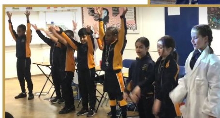
4S finished their assembly with a rousing song