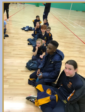
Mixed netball team for the LBWF 5-a-side tournament

High 5 Netball The juniors fielded a very strong team for this year's LBWF 5-a-side netball tournament. The mixed team of boys and girls had to follow a strict rotation of positions which always kept a balance of three girls and two boys in court in different positions for each new game. Normanhurst got off to a strong start winning their first game. They had a little blip and lost the second but went on to win the last three with confidence and not conceding any goals. They improved with each game and are waiting to find out if they have progressed to the next round. Well done every one who played.