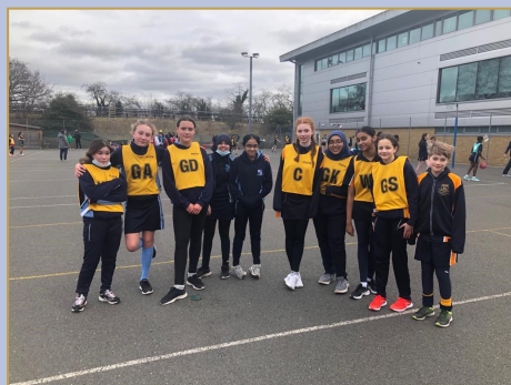
U13 Oak-Tree team

ISA Netball This year we combined forces with Braeside to form an U11 and an U13 netball team to represent Oak-Tree Schools in the London North netball tournament held at Redbridge Sports Centre. Teams travel from across the region to compete and the standard was as ever very high.