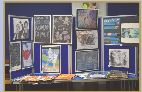
Showcasing the diversity of our Year 11 artists