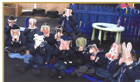
Animals of the Chinese zodiac

The Early Years had a wonderful week finding out all about the Chinese New Year of the Tiger. Throughout the week there were creative and musical experiences that took them all on a journey to China. On Monday afternoon, they created a Chinese themed role play area full of beautiful dressing up outfits and everything you need for a Chinese restaurant. On Tuesday the children came together for an afternoon exploring the tastes and smells of China as they enjoyed a Chinese banquet for afternoon snack. They made lanterns, wrote their names in Chinese writing and not only read the story of 'The Great Race', but acted it out with masks and props in the garden area.