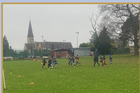
Tag rugby at Avon House

U9 Tag Rugby vs Avon House All pupils in Years 3 and 4 took the short journey to play our good friends at Avon House. Here, pupils began to put into place the tag rugby skills that they had learnt so far this term. There were some excellent individual displays and it was great to see pupils in these year groups return to competitive fixtures!