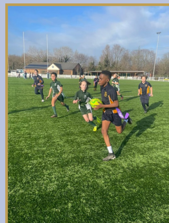
U11 Oak-Tree tag rugby

U11 Oak-Tree Mixed Tag Rugby On Monday 7 February the U11s participated in a tag rugby competition versus all schools that form part of the Oak Tree Group. Pupils from all four schools twisted and shuffled their way through waves of opponents in an attempt to score as many tries as possible. It is safe to say that this competition helped enhance pupils' understanding of the rules in tag rugby, and enabled them to have some sporty fun. The A and B teams from Coopersale Hall topped the tables, and both teams from Normanhurst finished in a very respectable 2 nd place winning four games out of a possible six.