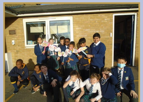
Enter the Year 5 dragon!

They then read the story 'The Nightingale' and discussed the relationship between the Chinese Emperor and the Nightingale. There were a lot of important themes that encouraged some intriguing discussions after the story. They then followed this with a Drama activity where the pupils were asked to summarise the