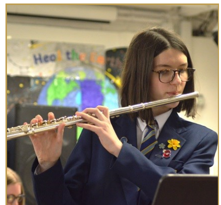
GCSE pupils performed a broad range of musical pieces