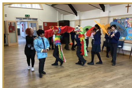
Chinese Dance Workshop