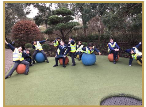
The Children's Garden was lots of fun

Everyone had a wonderful time and learnt so much!