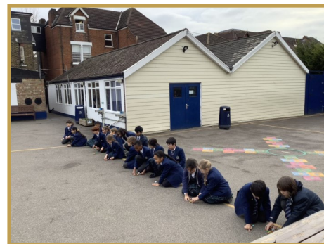
Ready! Steady! Catapult!

Year 4 also created some awesome Roman Raps about the Roman Gods and Goddesses. The children researched the Gods and Goddesses to find out some key facts and then wrote their raps in groups. They learned lots about the Roman deities, and then had a fantastic time performing their raps to their classmates!