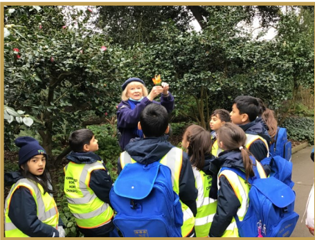
The children enjoyed sharing their knowledge of the plant life cycle with the workshop leader!

Kew Gardens On Wednesday 26 January, Year 3 travelled by minibus all the way to Kew Gardens to learn about pollination and plants! While they were there, the children attended a workshop where they learnt all about pollination and looked at pollinators at work. They also saw some plants from different countries and spent some time in the 'Children's Garden'.