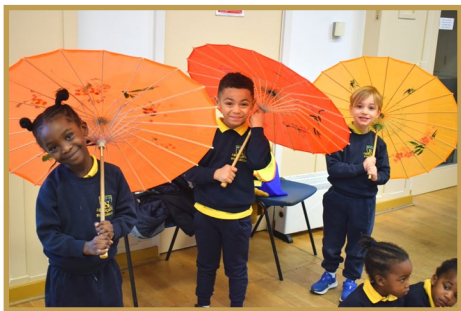
Three little pupils from Normanhurst are we!

One of the week's highlights was taking part in the Chinese Dance Workshop. Reception and Kindergarten had a wonderful time exploring different types of Chinese dance with fans and parasols, becoming a long red snake and even traditional Chinese dragons.