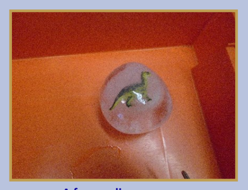
A frozen dinosaur egg

To conclude the dinosaur afternoon, they completed some dinosaur yoga! It was a brilliant day.