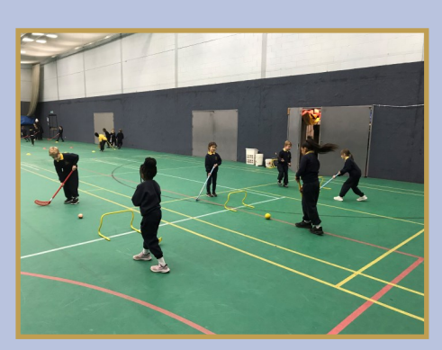
Younger pupils using unihockey equipment

This unit of work will culminate in a full round of inter-house matches during the last week before half term for all year groups.