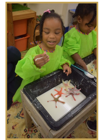
Great Barrier Reef sea creatures

There was lots of messy play to explore and they even