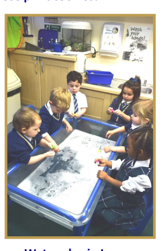
Water play in Lower Kindergarten