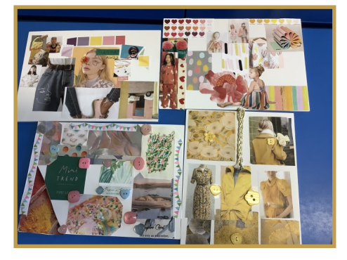
The children created these amazing mood boards—we have some budding fashion designers in the making!

Next, the children were introduced to the idea of a mood/storyboard. This is the initial concept of all designs. They build the board with inspirational images and a colour palette. This board will be used as the foundation of their garment designs moving forward for the following weeks. Next time, they will be looking at the initial sketching of garments.