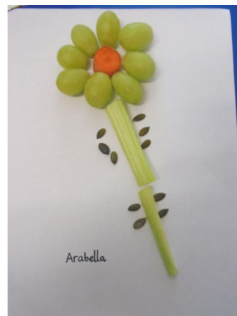
Arabella's fruit and veg flower

The children also used different fruit and vegetables and (the most important ingredient) their own imagination to make a flower. We had such a range of different flowers and they were all beautiful!