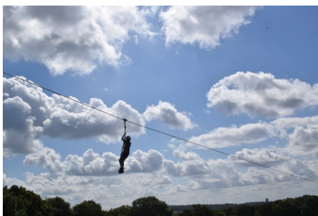
Overcoming fears to conquer the zip wire

We were extremely lucky with the weather, it remained hot and sunny all day. We split into two groups with all the girls in one group and three boys were happy to join them. Team A (the girls + 3) participated in the rock climbing activity in the morning. Everyone took part despite some fears of heights. The stars of the team were Janayd, Kyle and Rosa, who managed to get to the top of the rock wall.