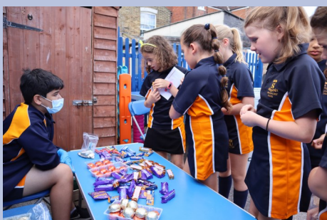
The sale was very popular with Junior pupils