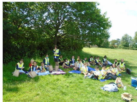
Year 5 enjoyed a picnic in the forest

They then had to work as a team to complete many different challenges using only certain body parts or movements. They had a lovely time and the sun shined all afternoon. Year 5 were very tired but happy on the walk back, and they cannot wait to be Year 6 from September!