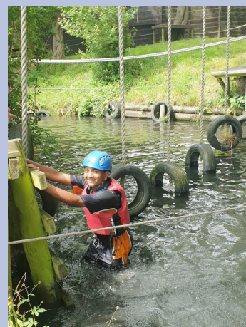
Here's the answer ...!

All in all it was a fantastic day for all involved!