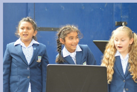
Year 1 put on a fantastic show for their parents

A big well done to the Year 1 pupils for putting on such a wonderful event; the playground was full of very proud parents and teachers.