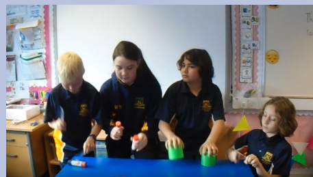
Making music like the Mayans

The pupils were given the task to create their own piece of Mayan music, using items from around the classroom to make their own instruments inspired by the Mayans. The children were focused and used excellent musical and historical knowledge to compose their wonderful pieces.