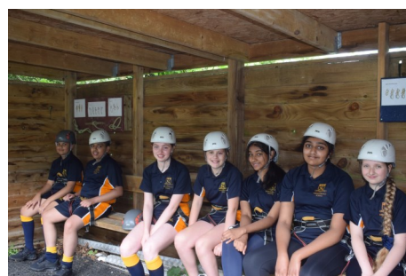
Exhausted but happy by the end of the day