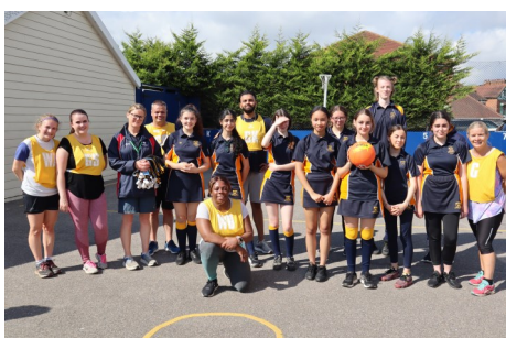
Year 9 and staff teams

The staff team was victorious in both the Year 9 and Year 10 matches. Well done to all!