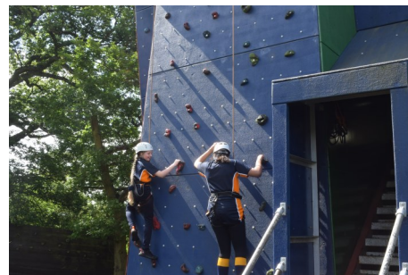
Scaling the rock climbing wall