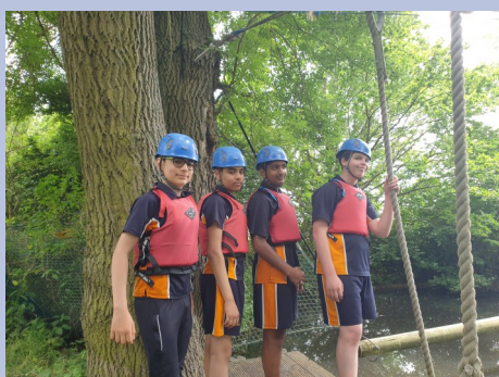
Would everyone make it across without getting wet ... ?

On 1 July Year 8 had the excellent opportunity to go to Lambourne End for a fun-filled day packed with activities. The children were split into three groups, and they all got the opportunity to have a go on some of the centre's most dare-devil activities.