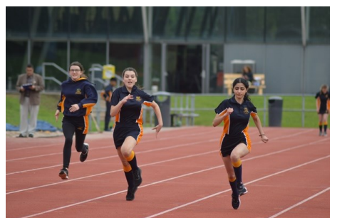
Pupils showed great determination