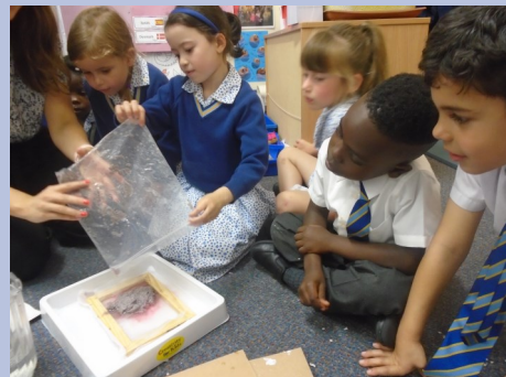
Reception making their own paper

Each class was able to look at two focus books, Carbon Monster and The Not So Green Queen . The children were amazed to learn that the paper that the books came wrapped in was made out of elephant poo! They watched a video showing how the paper was made, and learnt that an elephant poos between fifteen and twenty times a day! Reception were inspired to make their own paper (without the elephant poo), following instructions to create pulp to which they added coloured paper to make it brighter. They were very impressed with their beautiful finished paper.