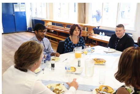
Guests, pupils and staff enjoyed an excellent lunch