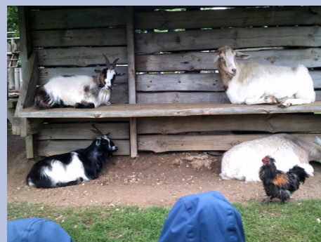
It was fun seeing the different animals that live at the Castle