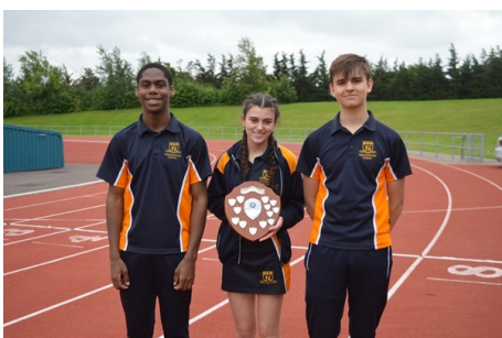
Connaught was victorious