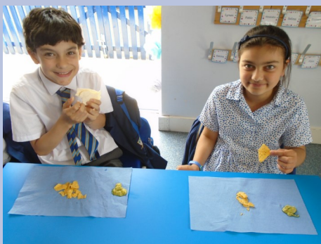
Enjoying Mayan snacks!

Continuing with their Ancient Mayan studies in History, the Year 5s have learnt about food from this time period. They learnt all about the kinds of food that the Mayans would have eaten and how they would cook their food. They found out they used the age old method of 'Hunting and Gathering' for their main food source but they also had a God that linked to their food known as the Maize God. The Mayans believed that maize/corn had magical powers and could heal people. They made most of their food from corn and the pupils enjoyed trying some traditional Mayan snacks in their lesson including corn chips and tortillas with an avocado dip. The Year 5s then agreed to go home and try out a traditional Mayan Hot Chocolate recipe that includes chili powder - they are very brave!