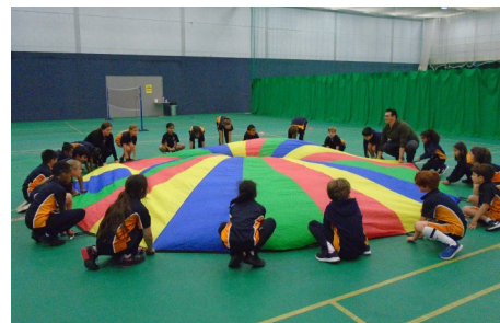
Year 3 have fun with the parachute at PE

Science Year 3 went out on a Forest Walk to look at how soil is formed, linking to their topic of 'Rock Detectives'. To understand how soil is formed, they have created their own 'wormery' in each classroom, showing how worms translocate the different levels of soil. The children explored the forest, searching for wiggly-worms to put into the wormery, and very carefully looked after them until the wormery was set-up. Once we have taken care of the worms, we will 'release' them back into the forest!