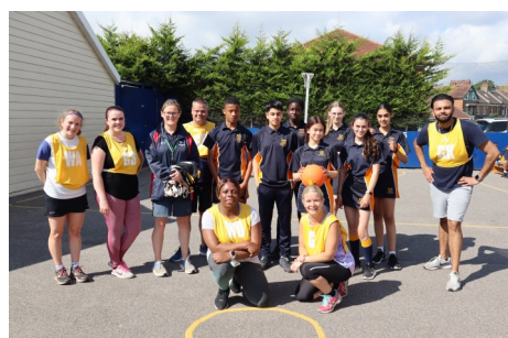
Year 10 and staff teams