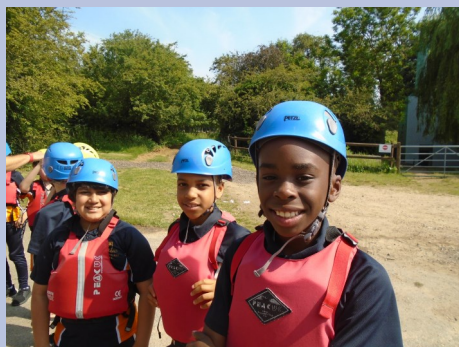
Ready for a day full of activities

On Thursday 24 June, Years 5 and 6 visited Lambourne End Activity Centre for their end of year trip. In groups they completed a ropes course, some of which was over water, and rock climbing. The children were very lucky to visit on such a sunny day, and after many falls into the swampy water they were especially grateful for the warm weather!