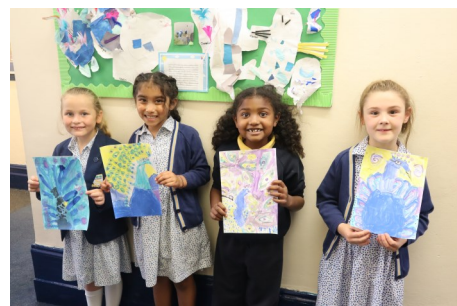
Happy smiles and beautiful peacocks on Moving Up Day