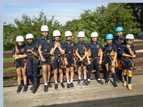
A great time was had by all!

The children were lucky enough to have their lunch break on a wide open field where they could run around and use the various equipment available to keep themselves active. All of the children agreed it was 'one of the best school trips EVER!' They have many funny memories to take away from the day and hope to return to Lambourne End soon.