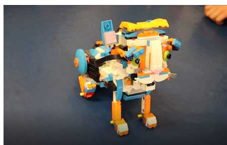
You can view a video of this incredible remote controlled Lego cat here .