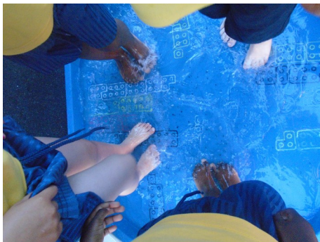
Cooling down and counting in 2s

"The tiny seed went to Africa." - Ahmet Cemal