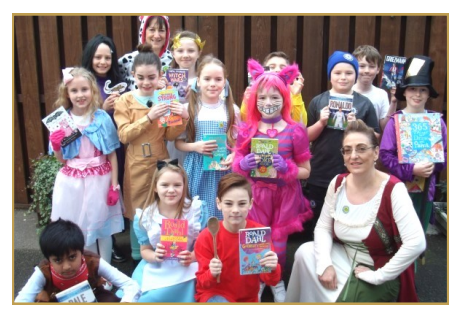
Coopersale Hall School