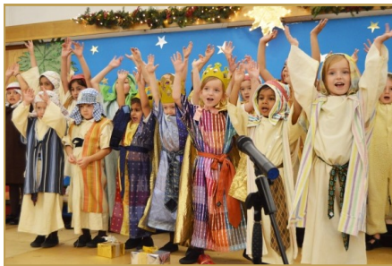
Braeside Junior Nativity

Braeside packed its end of term calendar with lots of Christmas events and activities. The younger children started their festivities with a trip to the post box to send their letters to Santa. Pupils enjoyed their Christmas lunch, panto visits, the FOBS Christmas Fayre, Christmas-themed crafts sessions and Christmas Jumper Day. They also enjoyed performing in the Carol Concert and Nativity.