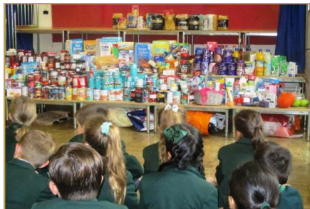
Oaklands Harvest Donations

donations collected were transported to the homeless at the Whitechapel Mission and have made a huge difference.