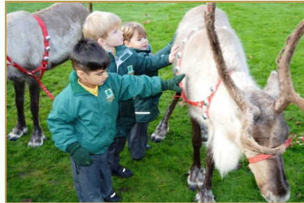
Coopersale Hall and some Special Visitors

Coopersale Hall wowed family and friends with their many Christmas performances and shows. Upper and Lower Kindergarten put on a 'A Little Present', KS1 performed 'Super Star' and Transition 'The Nativity'. There