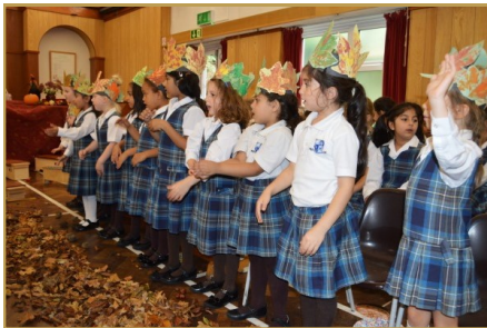
Braeside Harvest Festival

Braeside Juniors celebrated Harvest by showcasing a large selection of songs and poems to a packed audience. Each year group performed an individual poem extremely well, and the singing was of an excellent quality. Donations went to the Epping Forest Foodbank and were gratefully received.