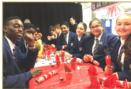
Normanhurst Christmas Lunch

Normanhurst pupils had a lovely lead up to Christmas, with pupils enjoying a delicious Christmas dinner together in the hall. Early Years and Infants gave three fantastic performances of their Nativity play to parents and the whole