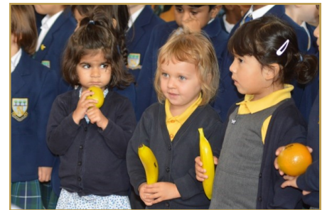
Normanhurst Harvest Festival