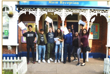
Normanhurst Exam Results

At Normanhurst, 92% of grades achieved were at A* to C or at the new grade 4 and above in English and Maths. There were 100% A* to C grades in subjects such as Art, Graphics, History, Drama, ICT, RS, Chemistry, Physics and Biology.