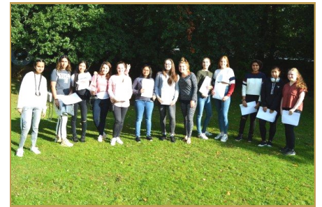
Braeside Exam Results

Across both schools there were some outstanding individual performances and all pupils should be very proud of their hard work and achievements.