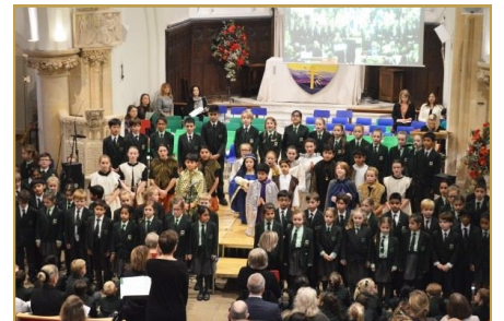
Oaklands Carol Service

Church for their Carol Service. The audience was treated to a moving retelling of the Nativity story using a range of songs, carols and Bible readings. It was a lovely way to get everyone in the Christmas spirit.