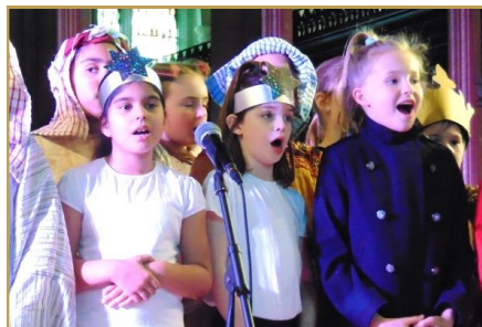
Coopersale Hall Carol Service

Nativity using song and dance. The energetic 'Oh What a Night' made a fantastic grand finale!