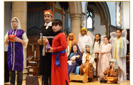
Normanhurst Carol Service

Church for their Carol Service. The audience was treated to a moving retelling of the Nativity story using a range of songs, carols and Bible readings. It was a lovely way to get everyone in the Christmas spirit.