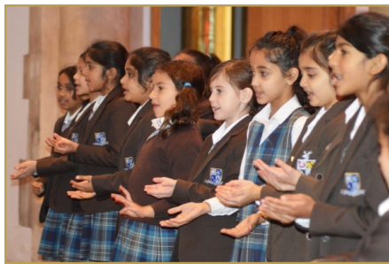
Braeside Carol Service

Years 1 to 11 came together in December at St John's Church in Buckhurst Hill for the annual Carol Service. The festive event was celebrated with Bible readings, Christmas poems and songs by the choir and band.