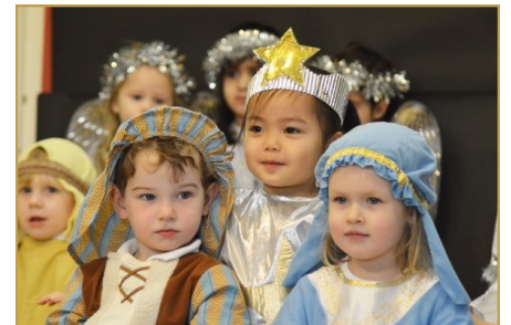
Oaklands Garden Room Nativity

school took part in a festive Christmas Carol service. There were also visits to the local pantomime, Christmas crafts, concerts at the local care home and lots more to help get everyone in the festive spirit.