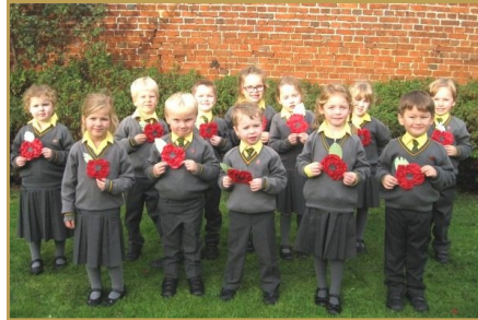
Coopersale Hall Poppy Making

Some of the children at Coopersale Hall made their own poppies in class while learning about why people wear poppies on this special day.